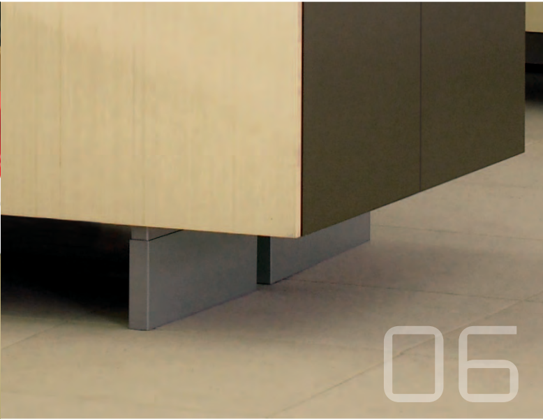
05 inset glass The Inset Glass blade is embedded in the panel to provide a clean design aesthetic and access to natural light. 06 district foot The District foot on credenzas offers a 3-inch adjustment range. A level cover maintains a refined design aesthetic.