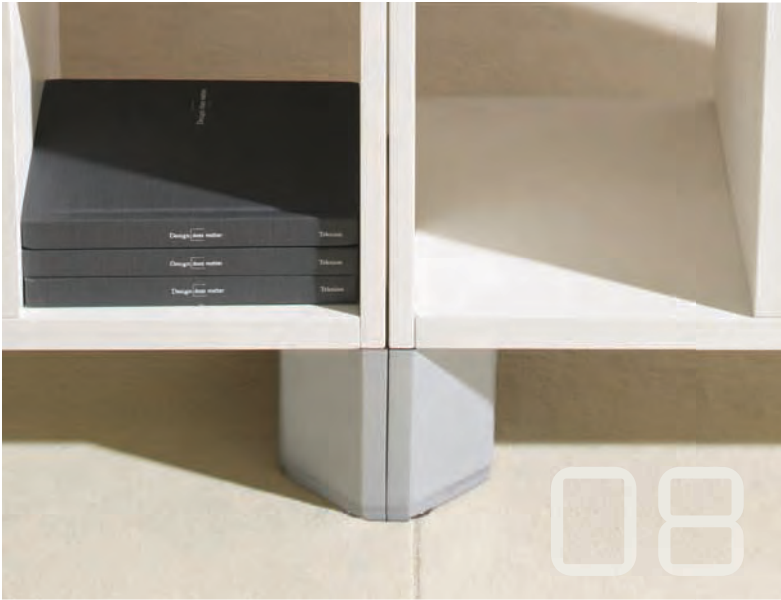
07 desk edge screen with tackboard Desk Edge Screens mount on- or off-module to the back or return edges of a worksurface to provide privacy. They can be used with a tackboard for added functionality. 08 angled foot An angled foot option on storage units enables stand-alone spine applications. The foot offers a 3-inch adjustment range.