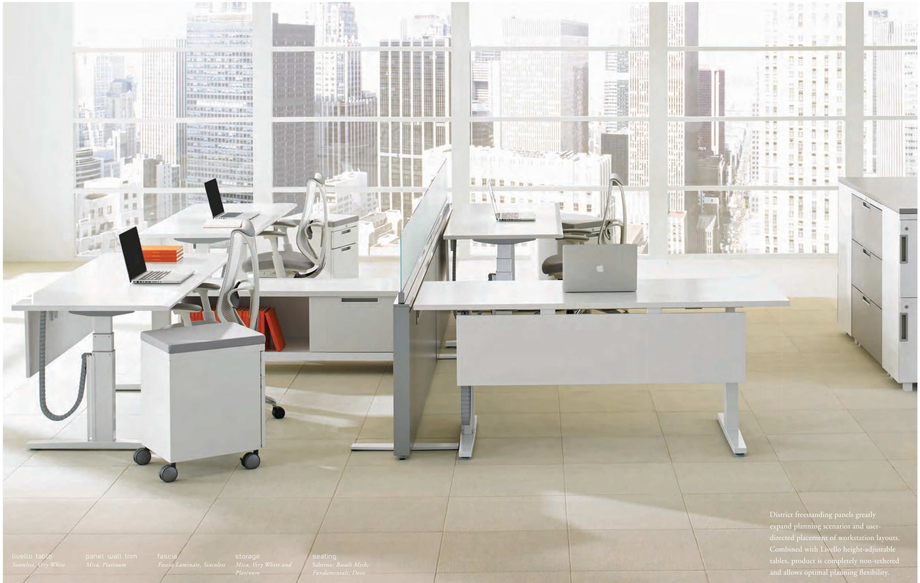
livello table Seamless, Very White