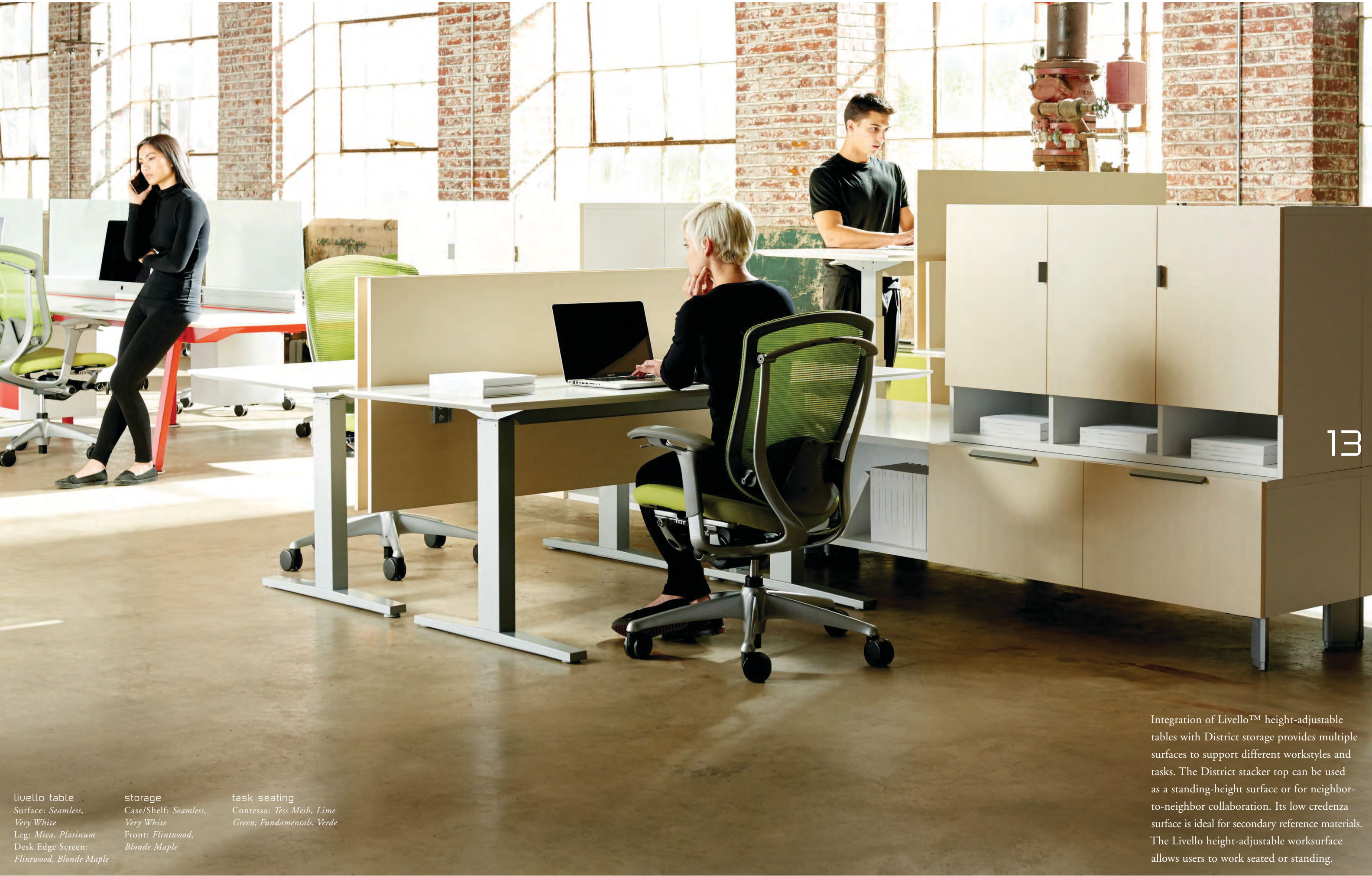
livello table storage task seating Surface: Seamless, Very White Case/Shelf: Seamless, Very White Contessa: Tess Mesh, Lime Green; Fundamentals, Verde Leg: Mica, Platinum Front: Flintwood, Blonde Maple Desk Edge Screen: Flintwood, Blonde Maple

Integration of Livello™ height-adjustable tables with District storage provides multiple surfaces to support different workstyles and tasks. The District stacker top can be used as a standing-height surface or for neighbor-to-neighbor collaboration. Its low credenza surface is ideal for secondary reference materials. The Livello height-adjustable worksurface allows users to work seated or standing.