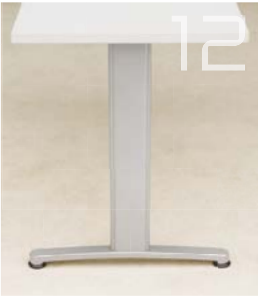
01 livello meeting tables

Livello Flip-Top Meeting Tables are available fixed or a height-adjustment range from 28"–46". Two-piece tables split to accommodate space reconfiguration, offering increased planning capabilities. Tables nest and store in minimal space.