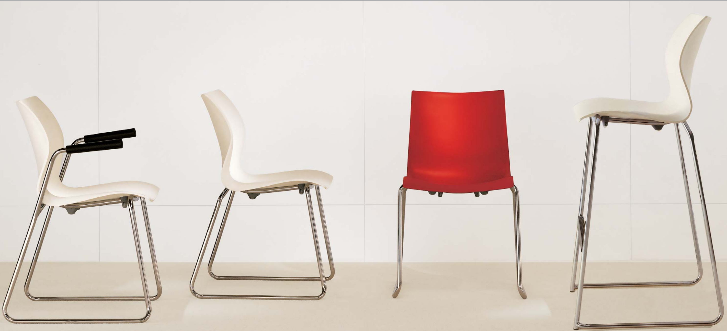
^ MODEL: Stacking Chair with Integrated Arms SHELL: Storm White FRAME: Chrome