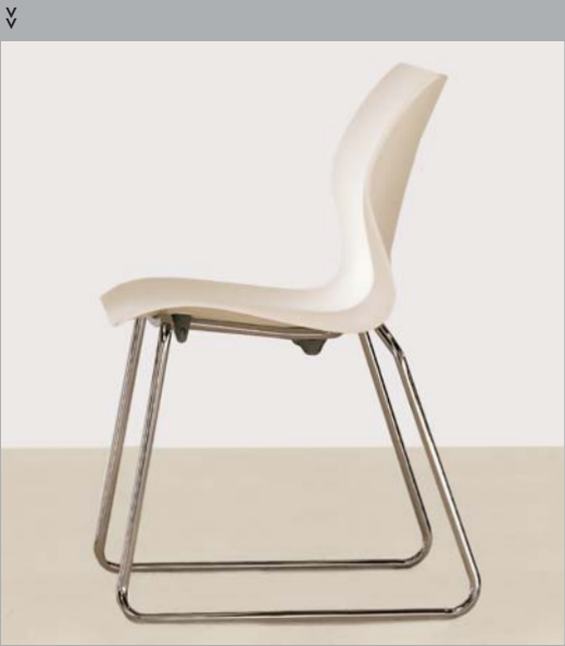
SHELL: Storm White FRAME: Chrome