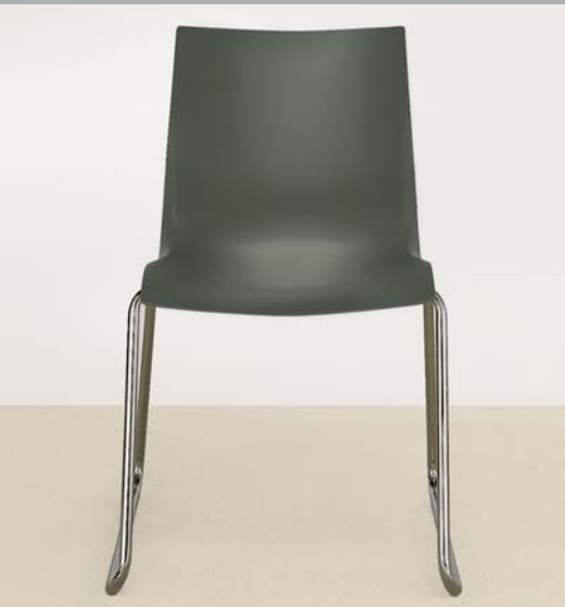
SHELL: Lunar Grey FRAME: Chrome