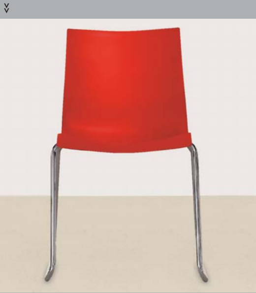
SHELL: Fearless Red FRAME: Chrome